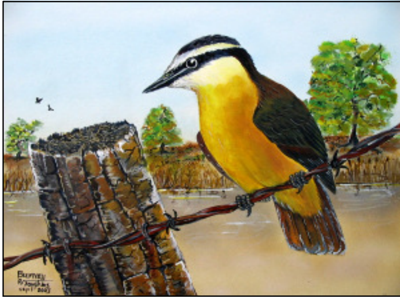
"The Great Kiskadee"

One very hot morning in May, I was collecting butterflies in South Texas. Then in the heat of the day, I caught a flash of yellow near the far bank. What was that? Something hit the water. All of a sudden a bright yellow bird emerged from the water and flew to a nearby post. What kind of a bird was it and what kind of a call was that? Was it a flycatcher or kingfisher?