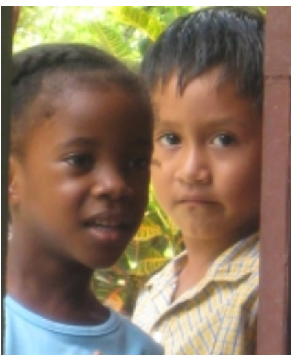
The local children will learn about Jesus through Vacation Bible School.