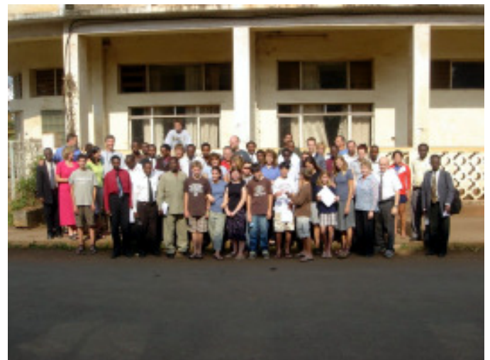
The group of missionaries and volunteers poses for a picture.