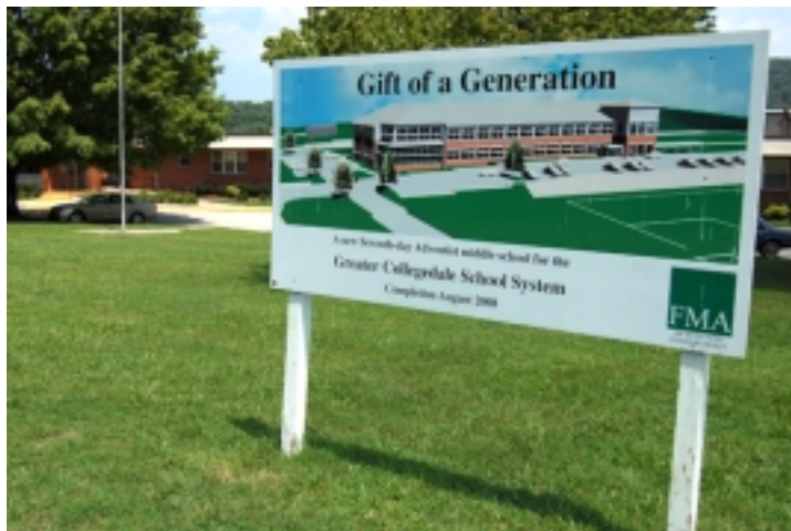
Construction on the Greater Collegedale School System's new middle school is scheduled to begin later this year.