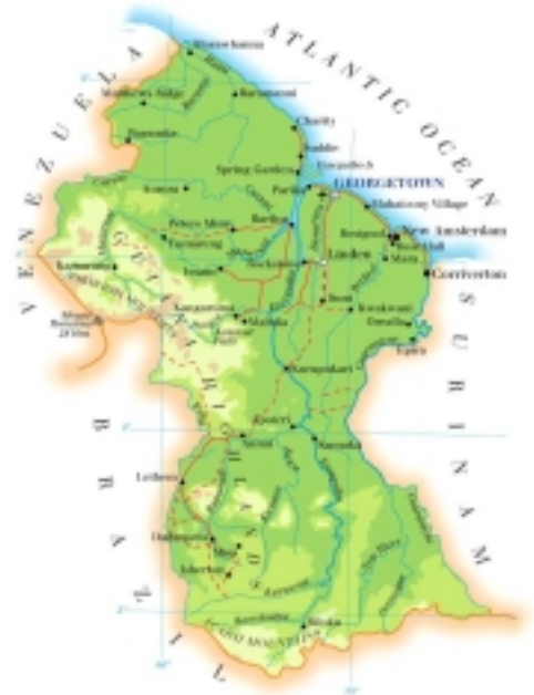
Bordered to the east by Suriname, to the south and southwest by Brazil and to the west by Venezuela, it is the third-smallest country on the mainland of South America.

Eight years ago, I had spent a week at the Peru Projects airbase taking jungle pilot survival training. It had been a tough week. I had spent much of that week struggling with God about His calling for me to fly missions. That training was on the 10th anniversary of my brother’s death in a mission aviation accident in central Mexico. By the end of the week God had made it clear to me that He had called, and I left Peru with the agreement to purchase an airplane from them to be used in our work in Guyana.