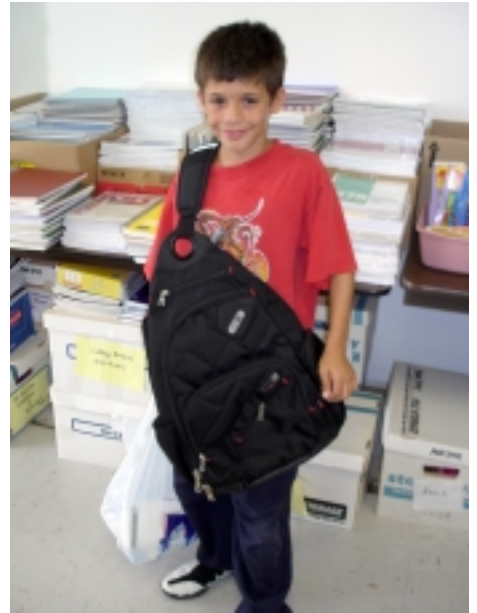
Last year, Stock Their Lockers helped more than 140 students.