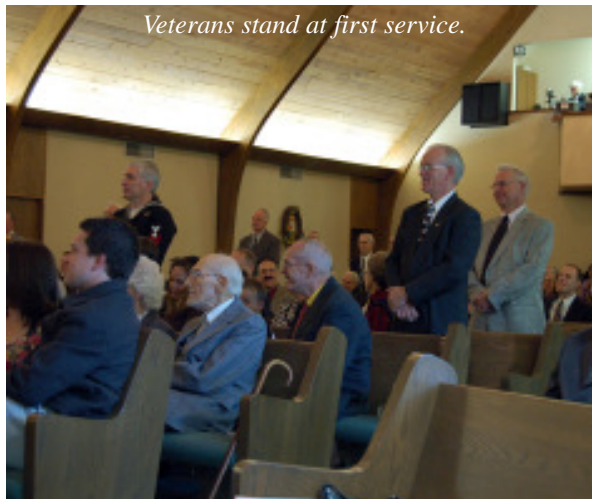
Veterans stand at first service.